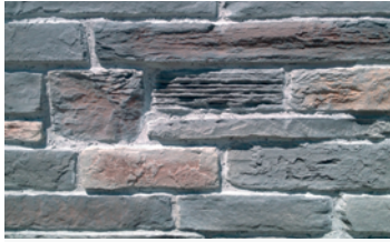
776 Mix Tirol