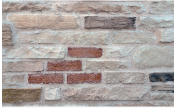
661 Mix Rustico