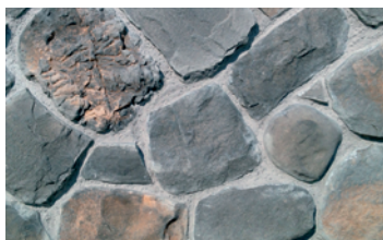
772 Mix Grigio