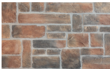
025 Mix Colorado