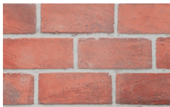
056 Brick Garda