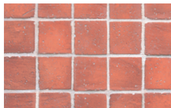
057 Brick Piccoli